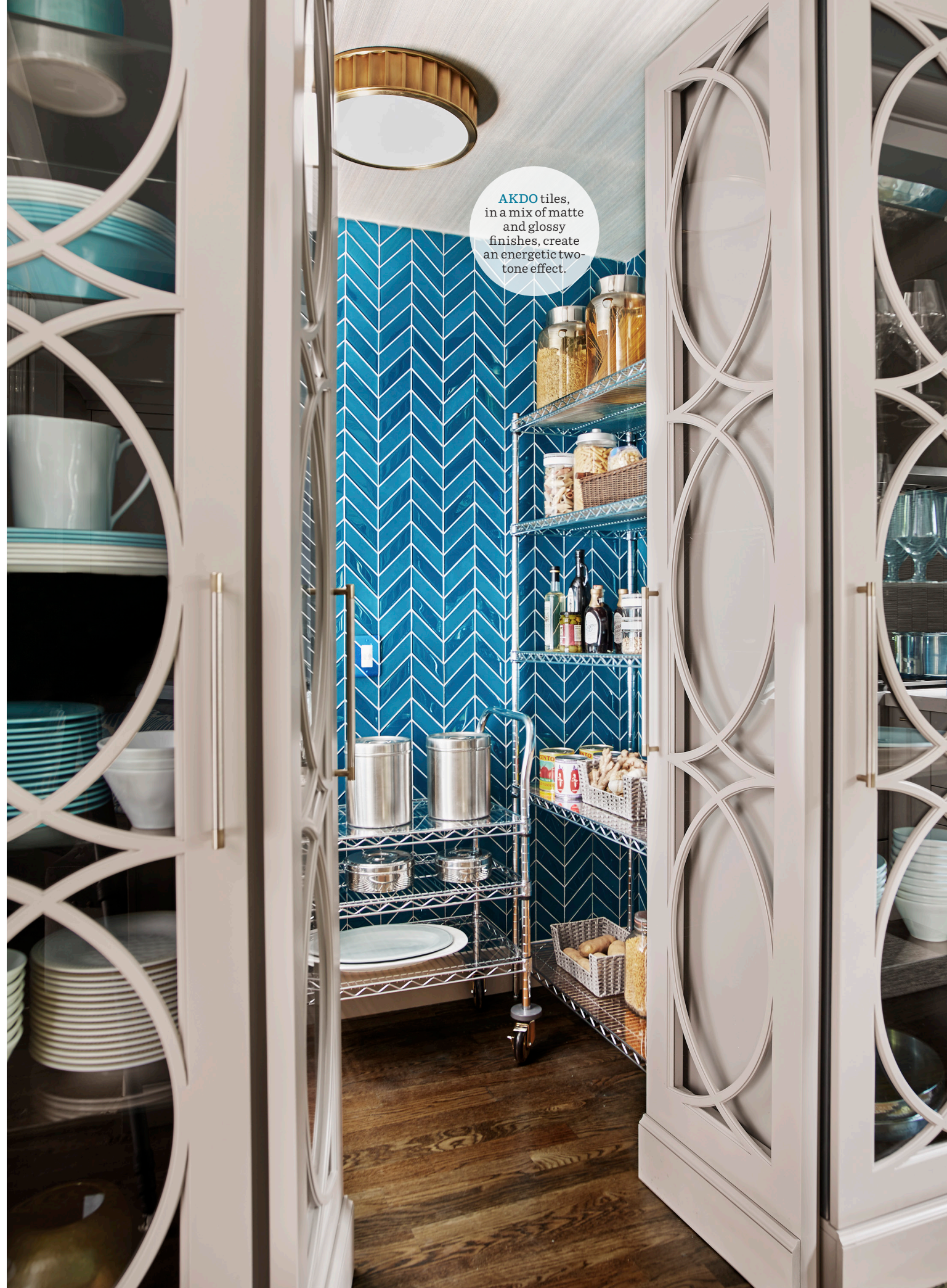
AKDO tiles, in a mix of matte and glossy finishes, create an energetic two-tone effect.