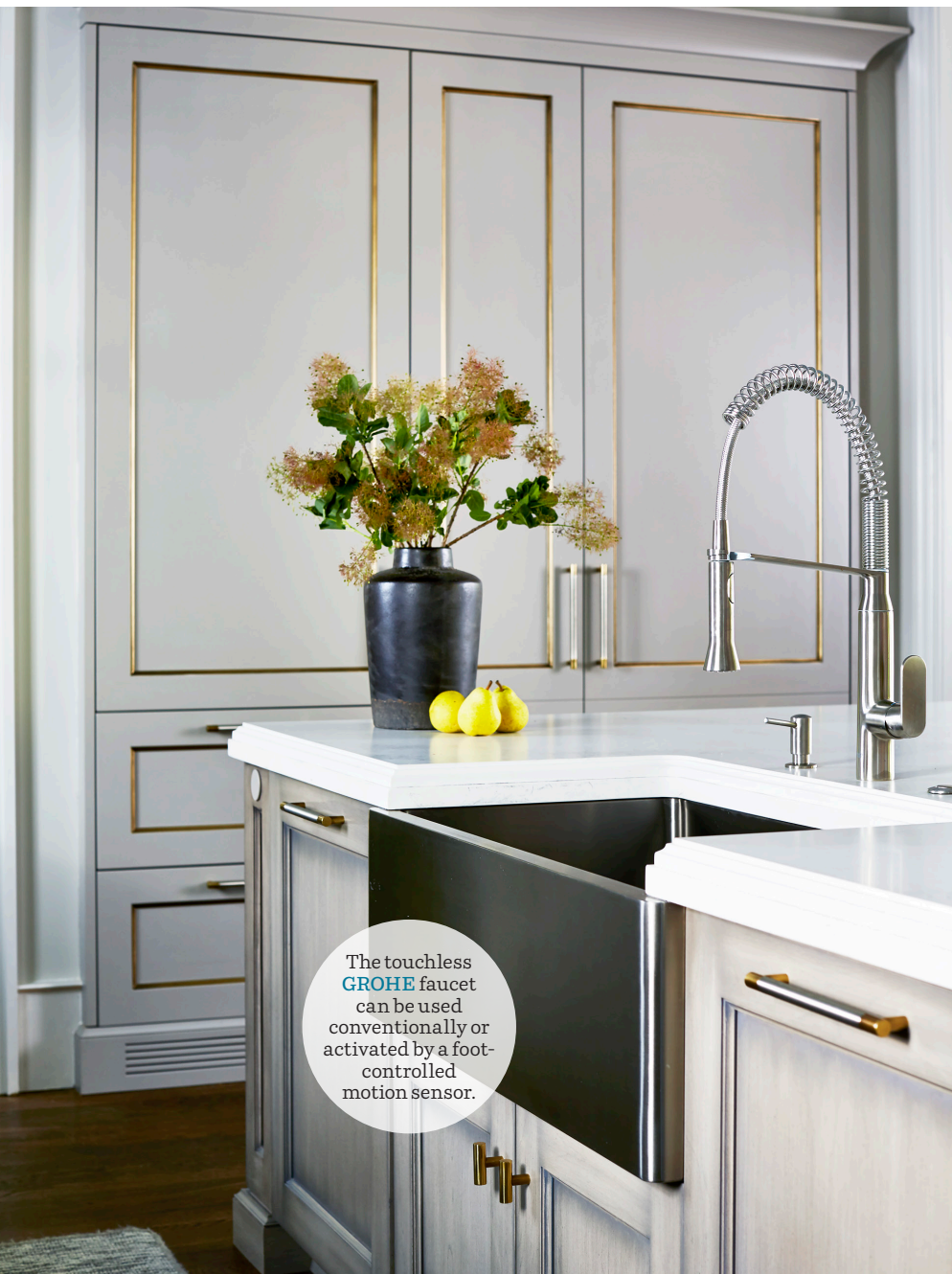
The touchless GROHE faucet can be used conventionally or activated by a foot-controlled motion sensor.